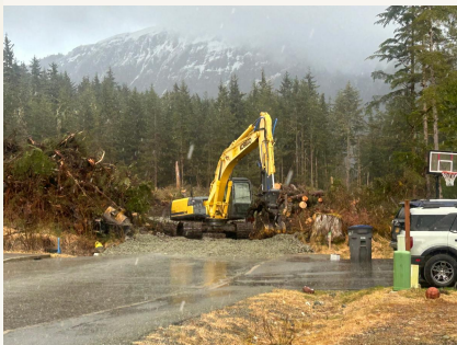
Juneau Pederson Hill

THRHA is proud to expand housing opportunities across Southeast Alaska. As we continue these projects, we remain dedicated to providing safe, high-quality homes that strengthen our communities. Stay tuned for more updates!